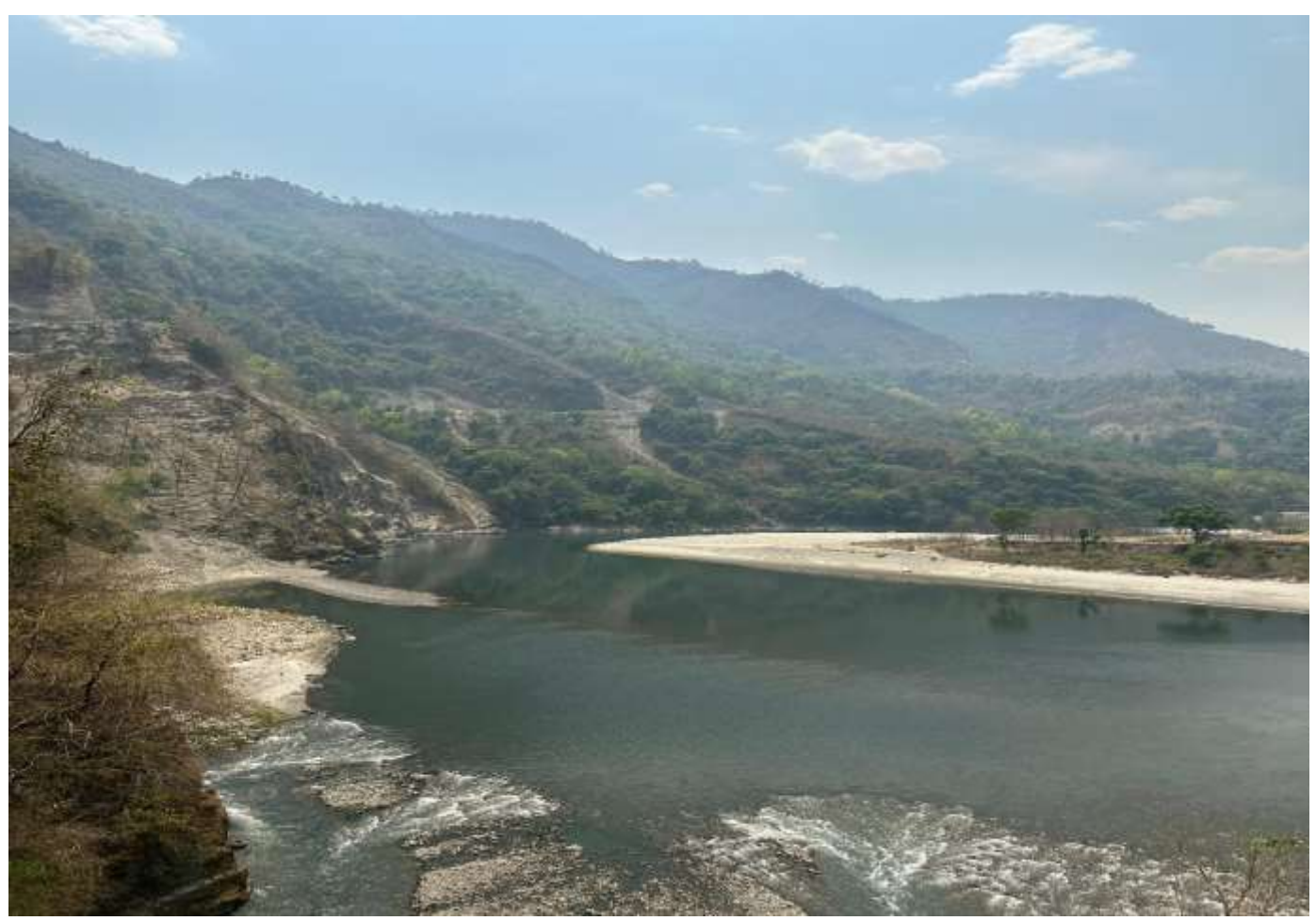
(PART 2: OPERATION MODALITY AND POSSIBLE SUPPORT TO NTFP/MAP ENTERPRISE IN THE LUMBINI PROVINCE)